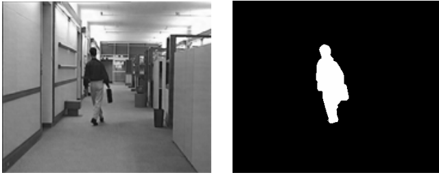
Fig. 1. Example of semantic segmentation result.

between the eye region and the upper cheek or between the eye region and the bridge of the nose. An example of face detection result is shown in Figure 2.