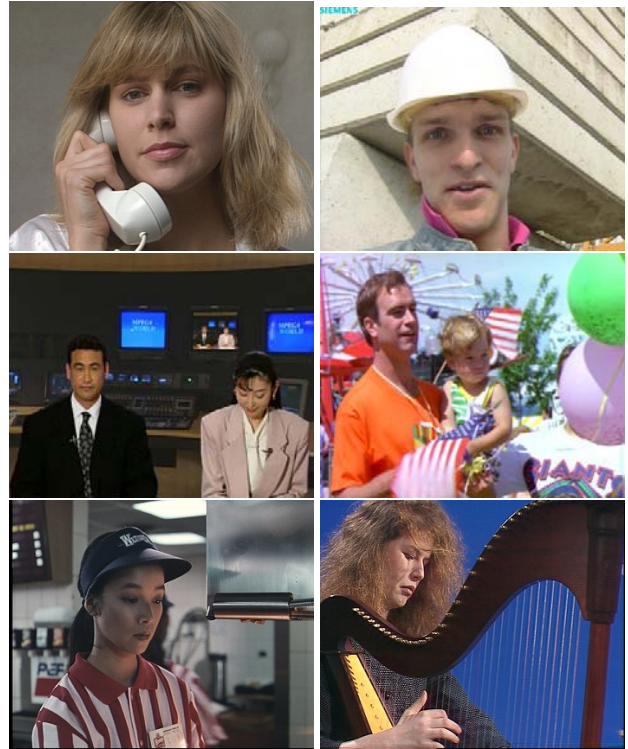
Fig. 3. Sample frames from selected test sequences.

The scenes we selected from these databases contain faces at various scales and with various amounts of head and camera movements. Some examples are shown in Figure 3.